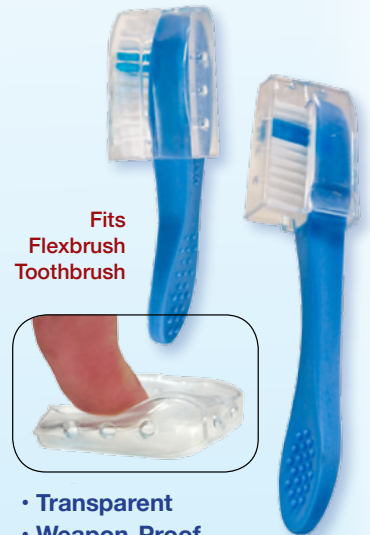
Fits Flexbrush Toothbrush