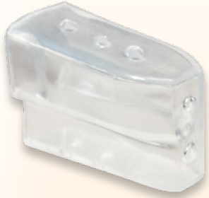
Toothbrush Cover Shown is Actual Size.

Patents, Trademarks and Trade Dress Issued and/or Pending.