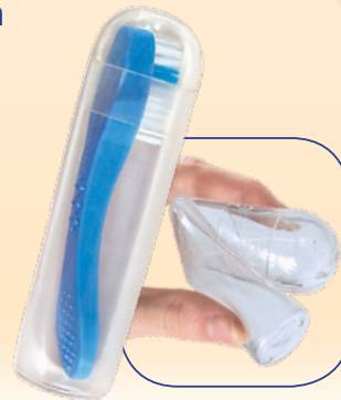
3" size Flexbrush Toothbrush